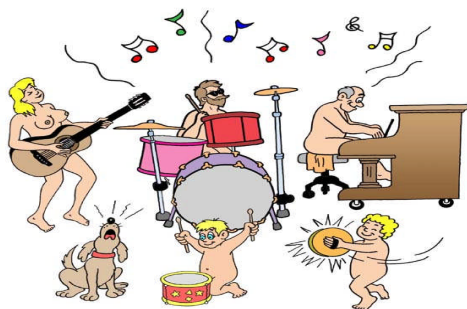
TALANT NIGHT, JUNE 28